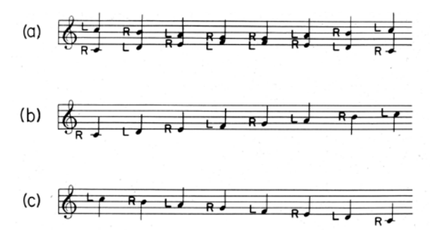
FIG. 1. (a) Representation of the dichotic tonal sequence employed in the experiment. This consisted of the C major scale switching from ear to ear, and presented simultaneously in both ascending and descending form. (b) Representation of the ascending component alone. (c) Representation of the descending component alone.

cessive tones alternating from ear to ear. This scale was presented simultaneously in both ascending and descending form, such that when a component of the ascending scale was in one ear, a component of the descending scale was in the other, and vice versa. Figures 1(b) and 1(c) show these ascending and descending scales separately; thus the sequence shown in Fig. 1(a) was simply the superposition of the two sequences shown in Figs. 1(b) and 1(c). The tones were sinusoids, of equal amplitude, and 250 msec in duration, with no gaps between adjacent tones. Each sequence was presented repetitively 10 times without pause. The tones were taken from an equal-tempered scale (International Pitch; A = 435) and the frequencies employed (in hertz) were C = 259, D = 290, E =326, F = 345, G = 388, A = 435, B = 488, and C = 517.